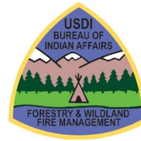
BIA, Division of Forestry & Wildland Fire Management