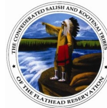
Confederated Salish & Kootenai Tribes