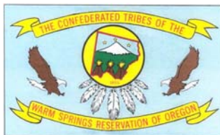
Confederated Tribes of the Warm Springs Reservation of Oregon