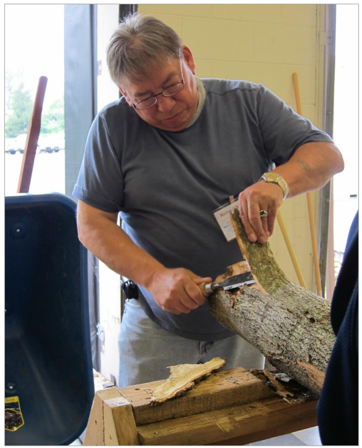
Micmac tribal member looks for emerald ash borer, an invasive species threatening the tribe's traditional basketry, in a black ash log. The Forest Service provided aid to the Maine Indian Basketmakers Association in its ash basketry marketing and entrepreneurship training efforts by partially funding a Wood Education and Resource Center authorized project in 2011.