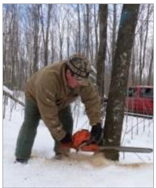
A Lac du Flambeau tribal member cuts a tree marked for firewood on the Chequamegon-Nicolet National Forest as a result of a revised Memorandum of Understanding.