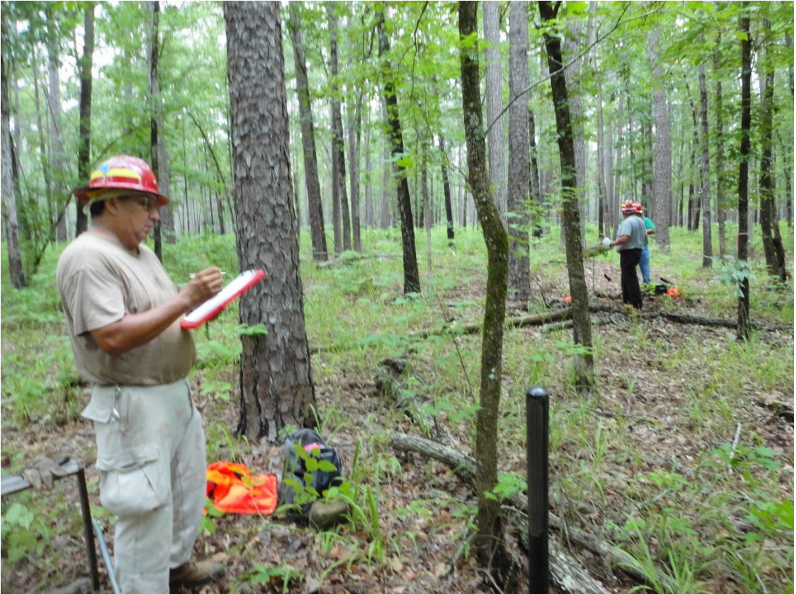
The Forest Service Southern Region uses a Master Participating Agreement to provide skills development and training for Caddo tribal members through work as heritage survey crews on Forest Service projects.