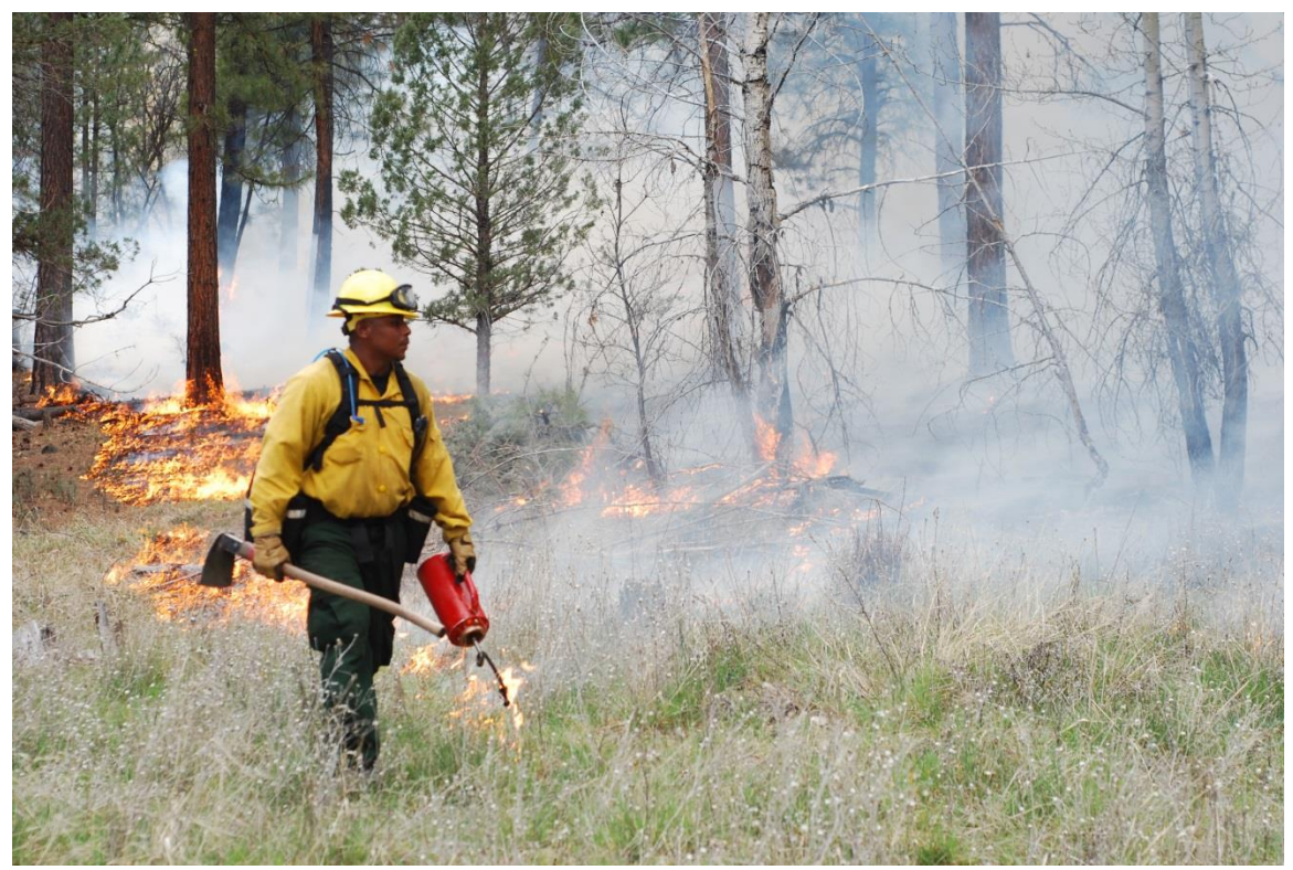
A Greenville Indian Rancheria Fire Crewmember on a collaborative underburn of the Maidu Stewardship Project, which emphasizes unique contracting and land management mechanisms that integrate traditional stewardship on culturally important Forest Service lands.