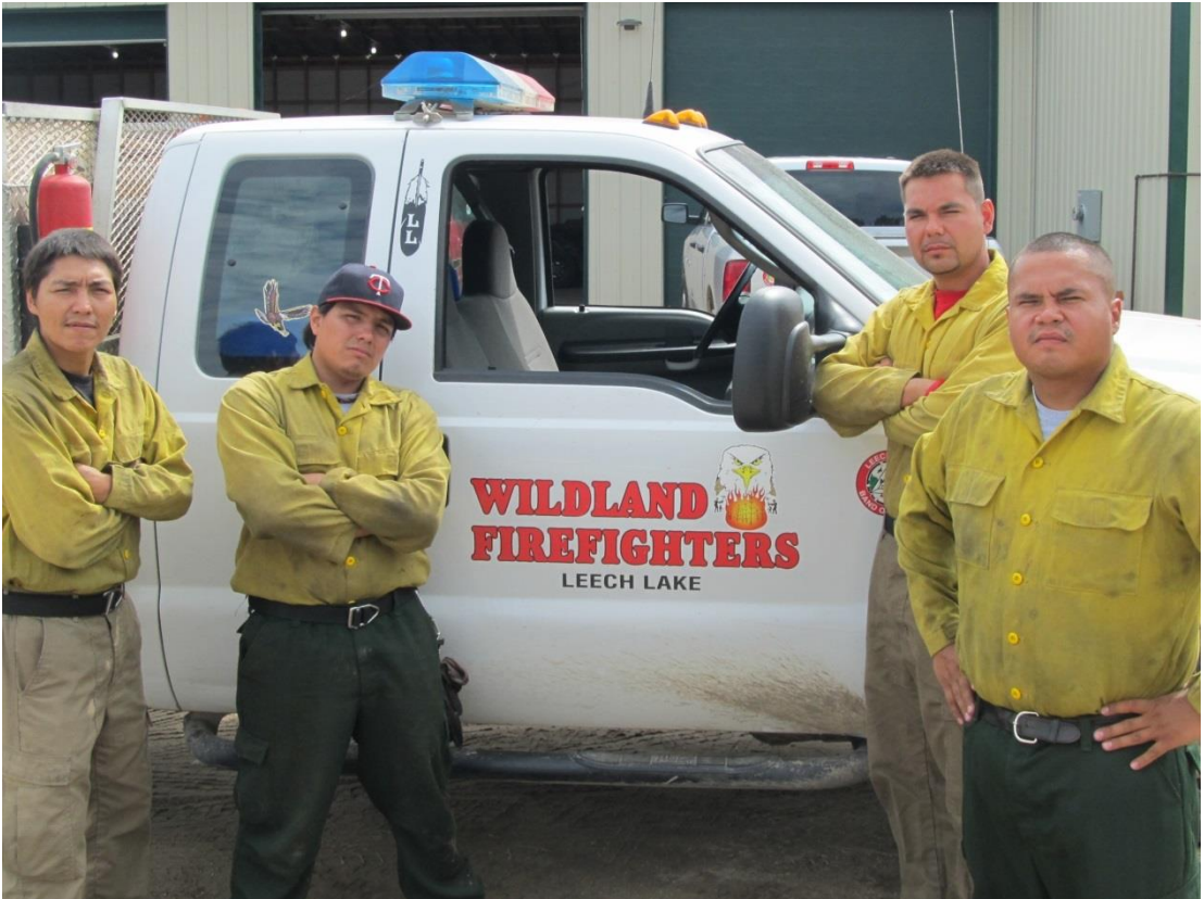
The Leech Lake Wildland Fire Crew has conducted projects with Hazardous Fuels Treatment, Wildland Fire Hazardous Fuels funds.

Note : If your Indian tribe is not seeking funding or a partnership, here are other opportunities to work with the Forest Service: