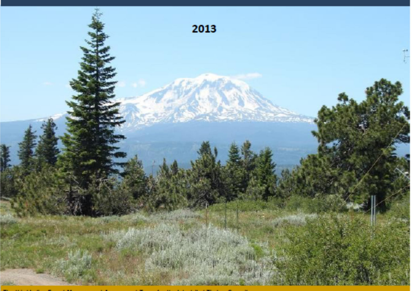
The third Indian Forest Management Assessment Team for the Intertribal Timber Council