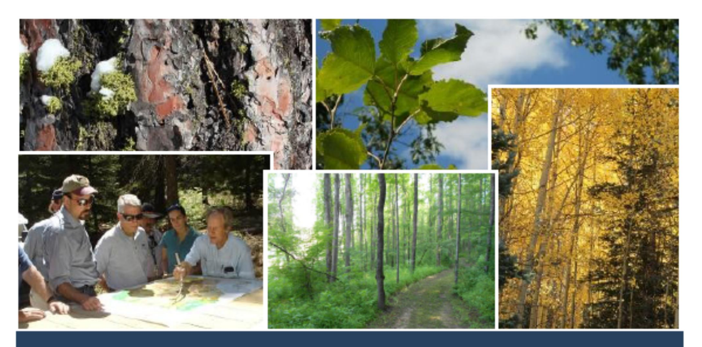
Assessment of Indian forests and forest management in the United States Volume II