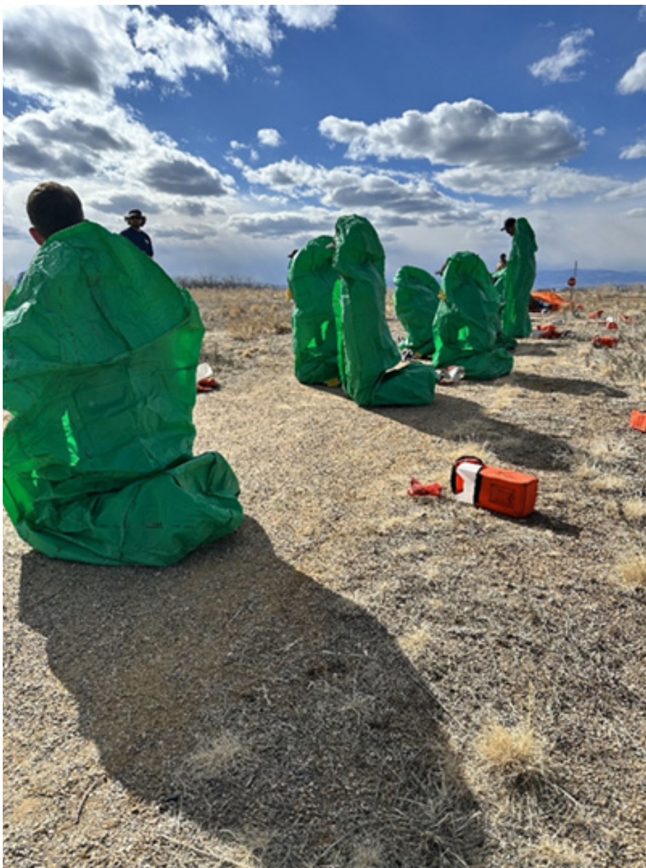
Figure 1. Attendees practicing fire shelter deployment during the 2025 RT-130 Fire Refresher Course.

July 14 - July 25, 2025: Wind River Reservation White Bark Pine Surveys, WY; RMR