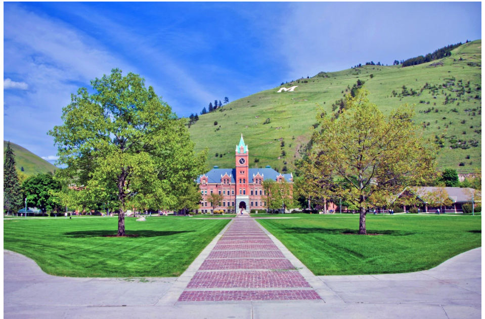
Photo of University of Montana Quad in Missoula, MT.

Online registration closes May 23. Visit the event website for details: https://www.eventsquid.com/event/27325 . Late prices begin on May 1. Register now to reserve your space! There is an option to pay later by May 23. Pur-