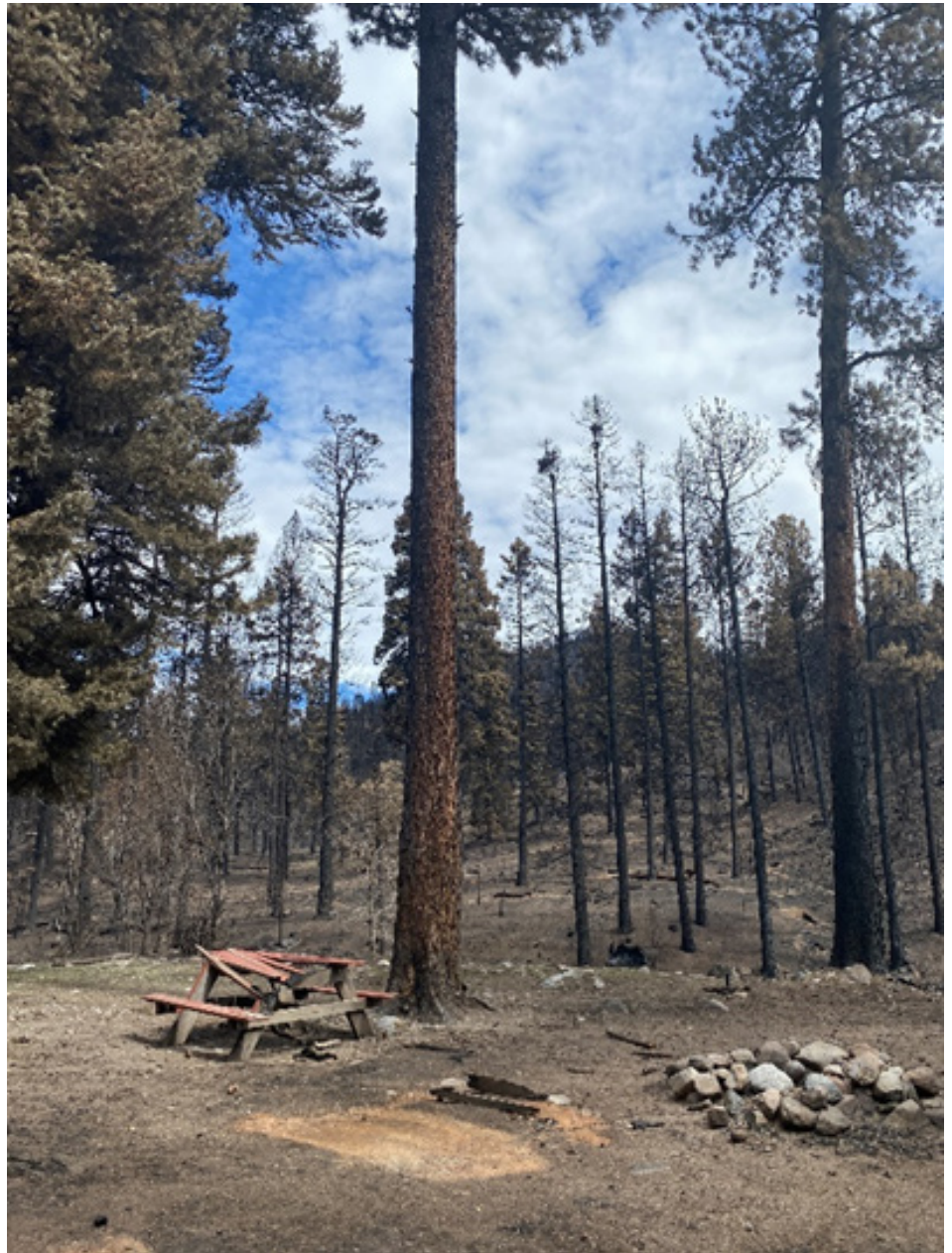
Figure 5. Assessing hazardous trees and damage to campground amenities from the 2024 Salt Fire in Mescalero, NM.