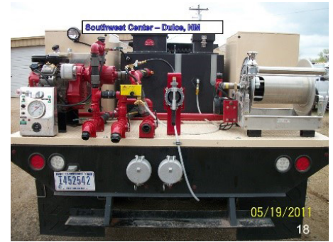
Picture of fire engine designs from BIA's fire fleet centers.

with the BLM-NFEP enables the DWFM to collaborate with other National Interagency Fire Center (NIFC) agencies in the procurement of a more modernized fleet, collaborating on issues associated with maintenance and safety recalls, and keeping up with advancements with technology such as the implementation of telematic devices.