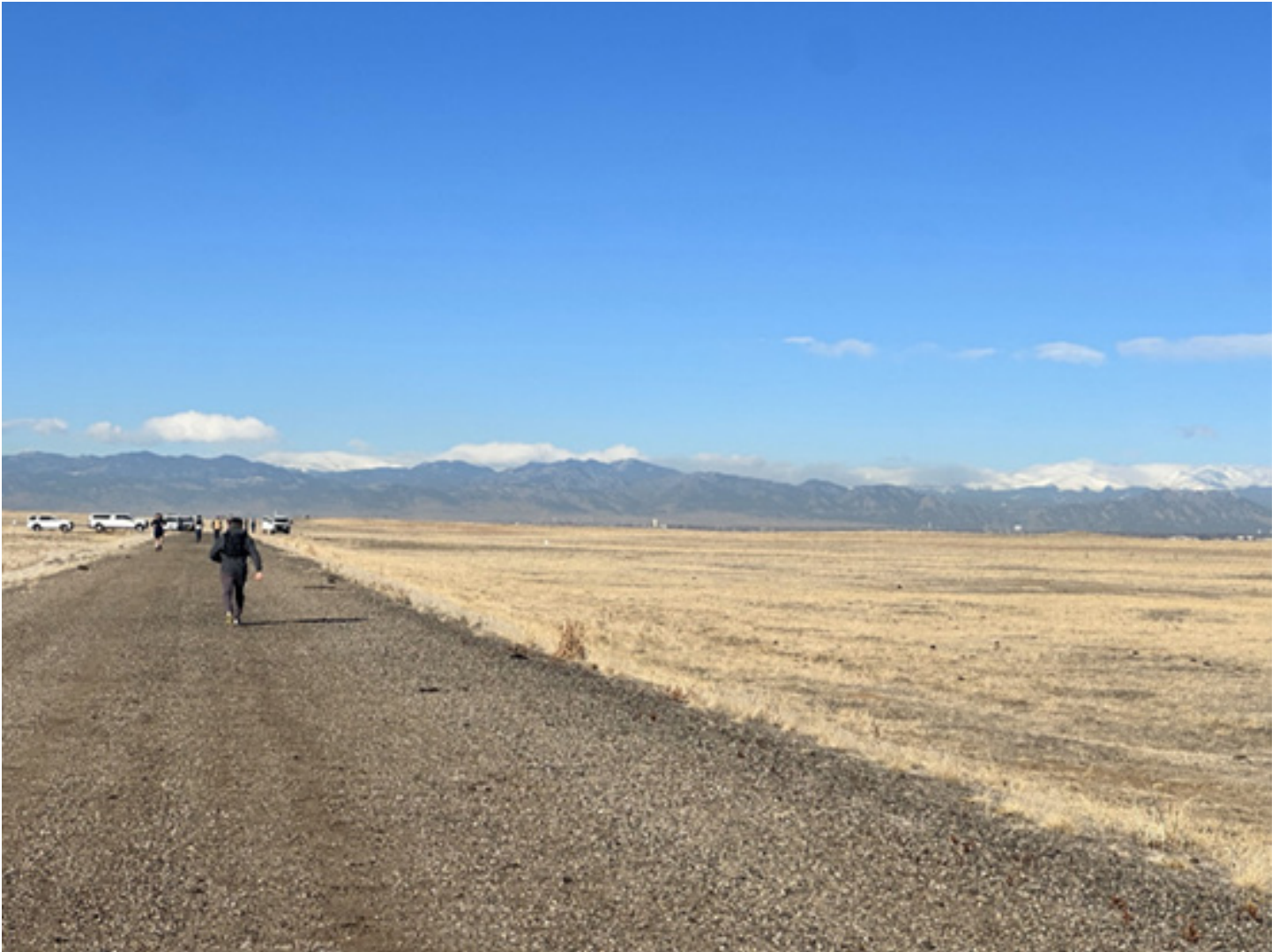
Figure 2. Attendees participating in the work capacity test at the Rocky Mountain Arsenal National Wildlife Refuge.

August 11 - August 22, 2025: Yakama Reservation Sale Prep, WA; NWR