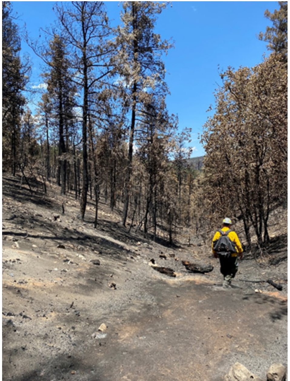
Figure 4. Assessing commercial timberland for natural reforestation potential after the 2024 South Fork Fire in Mescalero, NM.

by safeguarding sacred sites and traditional practices that depend on healthy ecosystems. BAER measures also enhance community safety by addressing hazards such as flooding and erosion that can arise after wildfires, ensuring the resilience of tribal communities. Furthermore, the federal funding associated with BAER alleviates the financial burden on tribes during recovery efforts while pro-