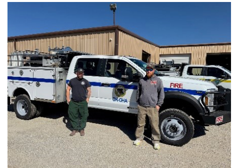
Pictured: BIA staff receiving fire engine training and engine acceptance at the contractor location in Weatherford, TX.

The Model 662, Type 6 engines that are being purchased by the BIA are being built by a contractor who has been building and manufacturing quality and reliable products, including engines built and designed for wildland fire suppression, since the 1980s. The new engines standardize BIA equipment with other federal agencies with active roles in wildland fire suppression who have also had equipment built by the same contractor. The newer, modernized engines provide BIA and tribal wildland firefighters the means to respond to and suppress fires in a better and safer manner, reducing the threat of wildland fire for communities throughout the United States. The modern-