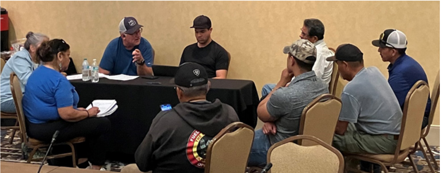
Figure 3. BIA BAER Foresters collaborated with the Mescalero Natural Resources Department to identify concerns from the 2024 Salt & South Fork Fire in Mescalero, NM.

lation of the legacy program from FORTRAN to the modern programming language CSharp. The FIP staff conducted a thorough review of research papers related to forest mensuration equations to ensure that the calculated values from the legacy program were accurate. They performed an initial verification of the analysis program, documenting the result computations and confirming the use of standard field names and codes. After identifying and fixing numerous errors through multiple reviews, the national analysis is now near completion, with only a minor fix remaining, expected to be resolved soon. A final review will be conducted to officially announce the national analysis program complete and ready for use.