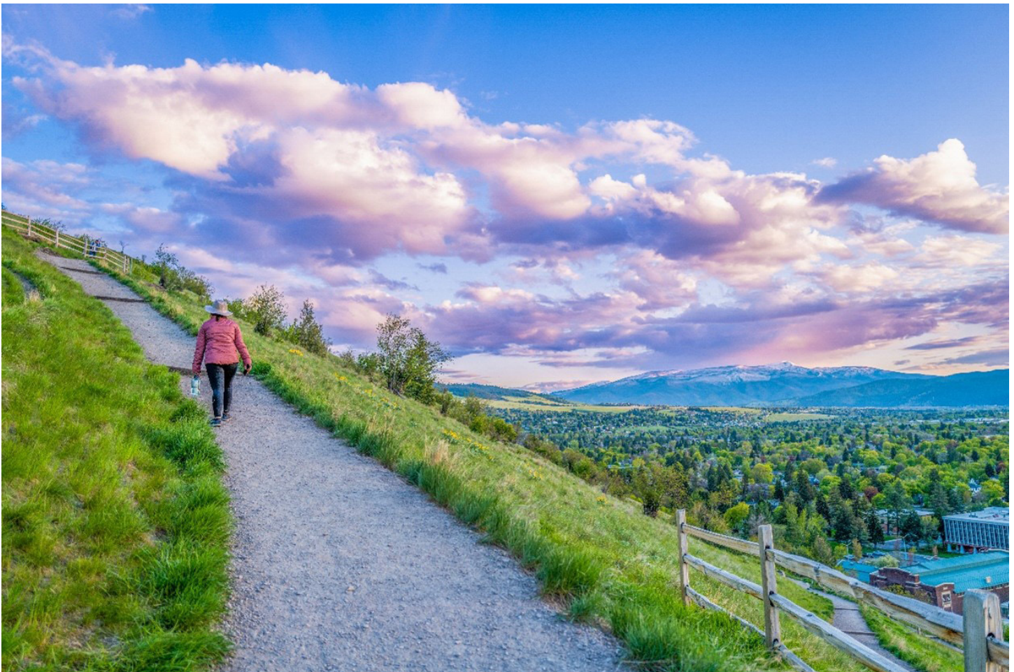
Photo of a hiking trail in Missoula, MT.

Thursday, June 5: The day's activities will start at 8:00 am with the ITC President's Report , then we will hear from Department of Interior Office of Wildland Fire, Bureau of Indian Affairs, Legislative, and U.S. Forest Service Office of Tribal Relations. Immediately following the Updates our ITC Workshops will start simultaneously at 10:30 am and end at 4:15 pm. Attendees are welcome to select one workshop or spend time in all