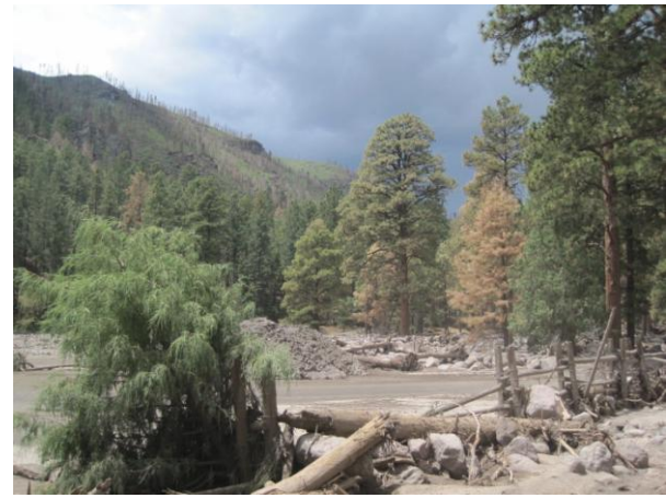
The TFPA can address hazardous conditions for wildfire which could damage lands and resources of concern to Indian Tribes. A series of three wildfires that originated on Forest Service lands affected the headwaters of Santa Clara Creek and contributed to severe monsoonal flooding, extreme erosion of the stream channel and sedimentation of water retention and fishing ponds of the Santa Clara Pueblo Tribe. July 2012.

Volume II contains several appendices that support and supplement Volume I: (A) the TFPA; (B) results of online surveys; (C) success stories; (D) site visit reports; (E) proposed training modules; (F) reference materials pertinent to TFPA implementation; and the (G) methodology used to conduct the investigation.