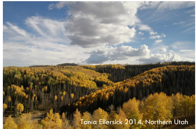
Tania Ellersick 2014. Northern Utah